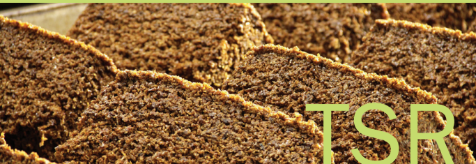
3) 1X Thick Pale Crepe (1XPTC)